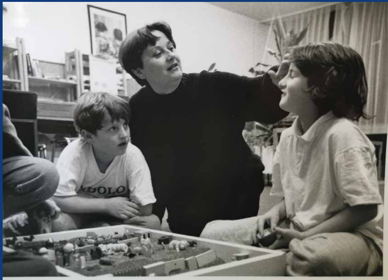
Mirha i djeca Medice Zenica.